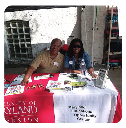
Back to School Festival/Health Expo.