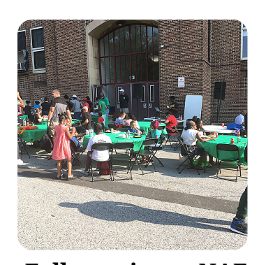
Fall opening at NAF