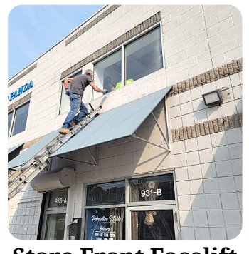
Store Front Facelift