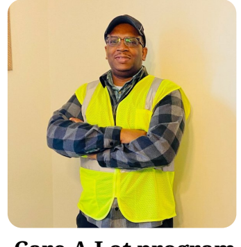
Care A Lot program